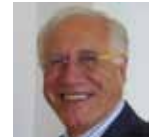
F. Gaita Turin, Italy