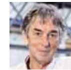
A.A. Wilde Amsterdam, The Netherlands