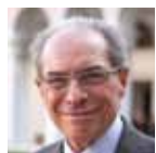
A. Raviele Venice-Mestre, Italy