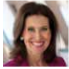
C. Linde Stockholm, Sweden