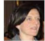
C. Basso Padua, Italy