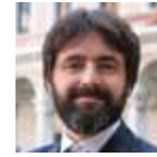
A. Rossillo Vicenza, Italy