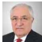
A. Oto Ankara, Turkey