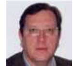
R. De Ponti Varese, Italy