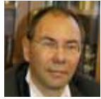
W. Jung Villingen-Schwen- ningen, Germany