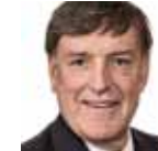
T.F. Deering Atlanta, USA