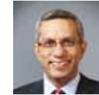
A. Al-Ahmad Austin, USA