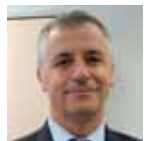
L. Mont Barcelona, Spain