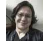
D. Aras Ankara, Turkey