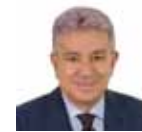
K. Adalet Istanbul, Turkey