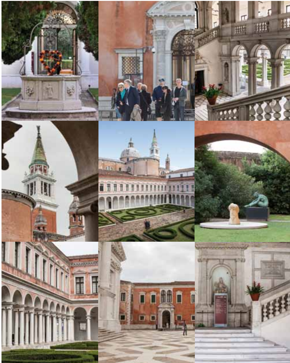
Fondazione Giorgio Cini