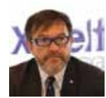
G.L. Botto S. Fermo della Battaglia, Italy